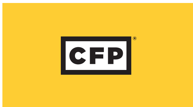
CFP® mark (with plaque design) certification logo

The image shows the CERTIFIED FINANCIAL PLANNER® word mark, which consists of the words "CERTIFIED FINANCIAL PLANNER" in a bold, black, sans-serif font, followed by a registered trademark symbol (®). The text is centered on a solid gray rectangular background. CERTIFIED FINANCIAL PLANNER®